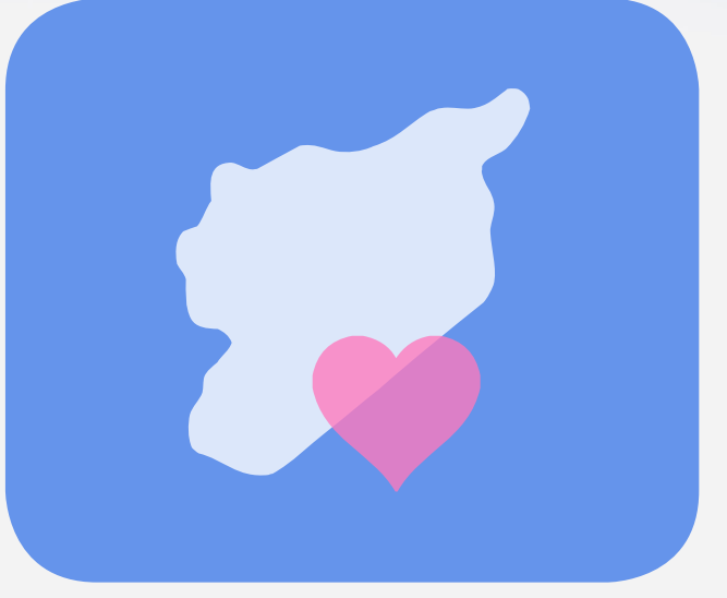
Life Joined The American Relief Coalition for Syria